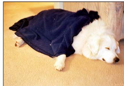
Bonnie dreams of her big adventure at the end of a long day.

Note from Mommy: The Perkiomen Trail is nice in that it goes past areas that have trash cans, poop bags, restrooms and soda machines. The Skorups would love to hike on the trail again in the future. Anyone interested in hiking with us should contact us.